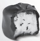
Too much of Whitman's art won't give you a stomachache.

reinvented Leaves of Grass , expanding and editing it in an effort to publish his quintessential collection. In essence, Leaves of Grass was Walt himself in verse form. Walt Whitman changed poetry. His life's work was ahead of its time. And though he lived long before the Summer of Love, he was the original beatnik — an inspiring example for writers like Ginsberg and Kerouac.