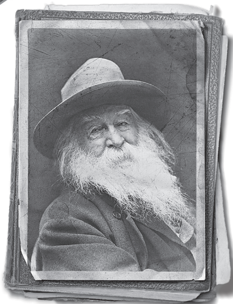
Whitman satisfied his sweet tooth with rich, wave-like verse. Every kid should make poetry a part of his diet.

Throughout his career, Whitman rewrote and