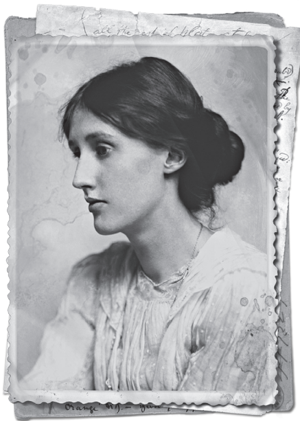
One of the world's most influential writers, Virginia Woolf. Novelist, writer, not Canis lupus .

During the Post-Impressionist movement, Virginia was influenced to reject linear writing. Her most well-