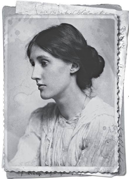
One of the world's most influential writers, Virginia Woolf. Novelis writetis, not Canis lupus.

During the Post-Impressionist movement, she was encouraged to reject linear writing.