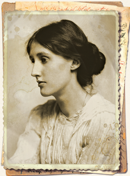
One of the world's most influential writers, Virginia Woolf. Novelists writers, not Canis lupus.

During the Post-Impressionist movement, Virginia was influenced to reject linear writing. Her most well-