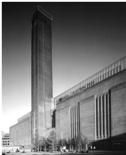
Tate Modern Building

For information, www.bcainc.org/thebcaten.html .