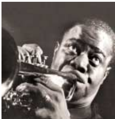
Instead of a giant leap, Louis Armstrong delivered one giant free-form crazy jazz groove for mankind.

It's a long way from the Apollo Theatre to the Apollo program. And while his playing may have been "as lofty as a moon flight," as Time magazine once suggested, that would be as close as Louis Daniel Armstrong would ever get to taking "one small step for man."