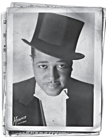
A piano player. A composer. An orchestra leader. Duke Ellington reigned over a land called Jazz.

His music spread across the world with songs like "Sophisticated Lady," "In a Sentimental Mood"