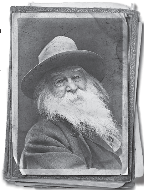
Whitman satisfied his sweet tooth with rich, wave-like verse. Every kid should make poetry a part of his diet.

Throughout his career, Whitman rewrote and reinvented Leaves of Grass , expanding and