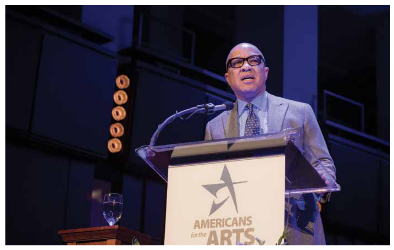
Darren Walker makes a powerful call to action for arts advocates to persist in their efforts: "This is not the time for a poverty of imagination in our country."

We must invest in our ambition, in our aspiration, in that American spirit of ingenuity and sense of imagination that has always propelled this great nation forward. This is not the time for a poverty of imagination in our country.