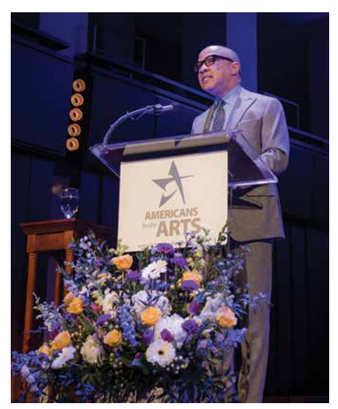
Darren Walker describes the unique role of the arts and humanities in addressing a kind of poverty that goes beyond money, but rather is a hunger in our souls for dignity and transcendence.

In fact, the arts and humanities are necessary to address a kind of poverty that goes beyond money—a hunger that lives not in our bodies but in our souls, a uniquely human hunger for dignity and for transcendence.